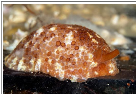
Pleurobranchus peronii (5)