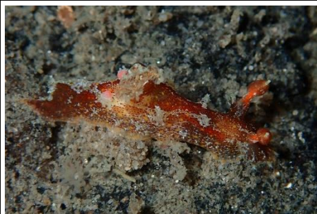
Plocamopherus ceylonicus (1)