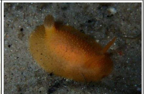
Onchidoris sp. 1 (2)