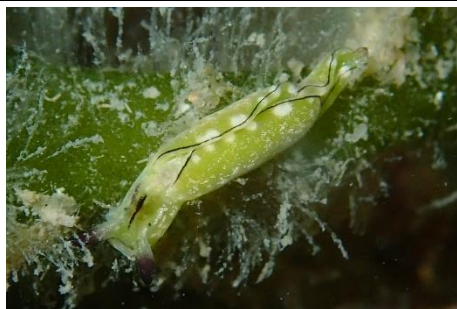
Elysia coodgensis (1)