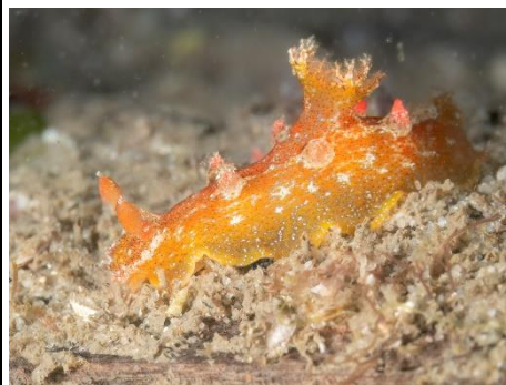
Plocamopherus imperialis (5)