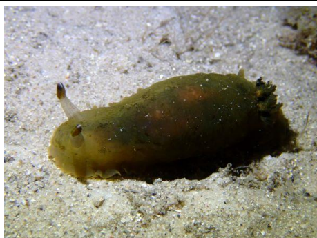
Dendrodoris fumata (2)