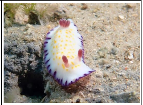
Goniobranchus aureopurpureus (10)