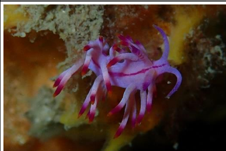
Coryphellina cf lotos (6)