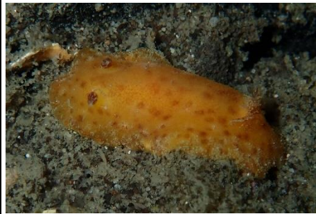
Discodoris sp.4 (1)