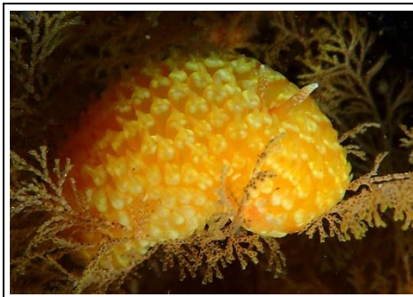
Janolus sp. 1 (orange) (1)