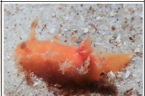
Kaloplocamus ramosus (3)