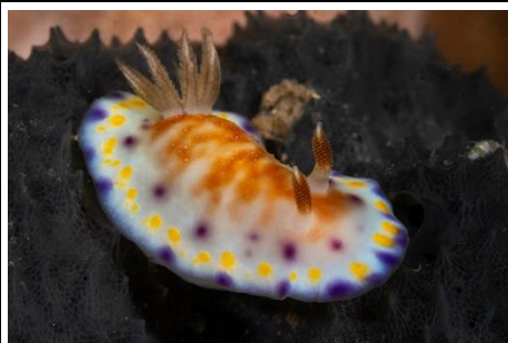
Goniobranchus collingwoodi (4)