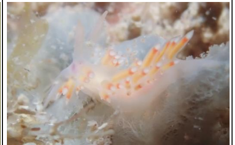
Coryphellina poenicia (2)