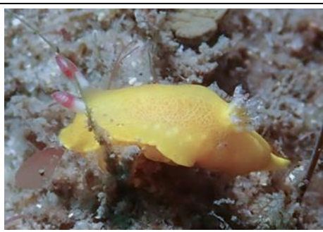
Verconia laboutei (1)