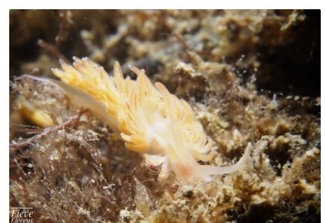
Phyllodesmium sp. 1 (apricot) (2)