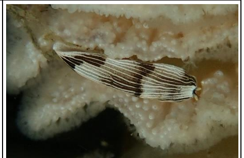
Dermatobranchus sp. 1 (2)