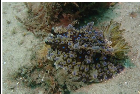
Dendrodoris krusensternii (4)