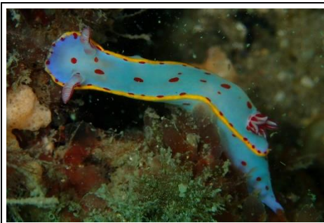
Hypselodoris bennetti (14)

The following pages shows all the species found on the census in order from most to least common. Numbers in brackets refer to the number of team sightings. All photos were taken by participants.