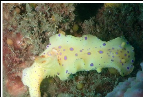
Ceratosoma brevicaudatum (3)