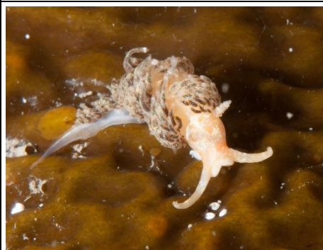
Austreaolis ornata (5)