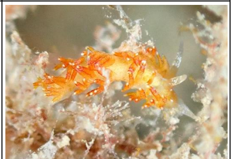
Tularia bractea (1)