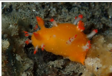
Kaloplocamus acutus (2)