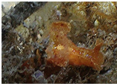
Notobryon wardi (1)