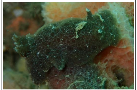
Jorunna sp.trd2 (1)