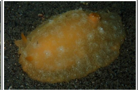
Doriopsilla peculiaris (1)