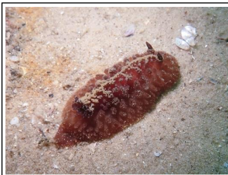
Atagema intecta (1)