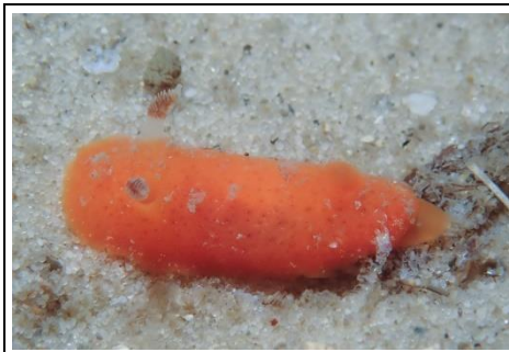
Rostanga arbutus (3)