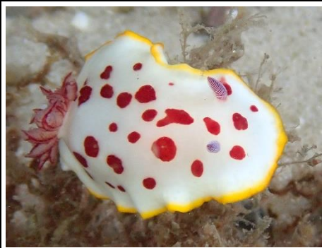
Goniobranchus splendidus (13)