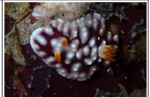
Goniobranchus geometricus (1)