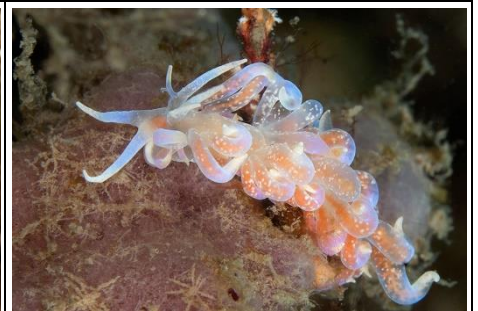
Phyllodesmium poindimiei (9)