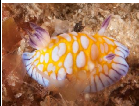
Goniobranchus roboi (1)