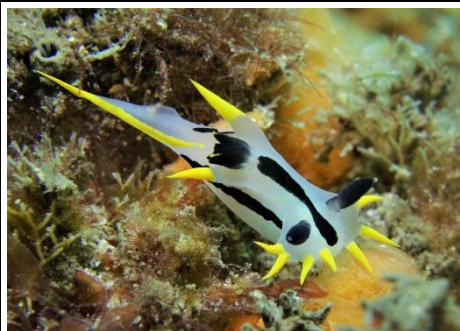
Polycera capensis (10)