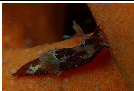
Trapania brunnea (1)