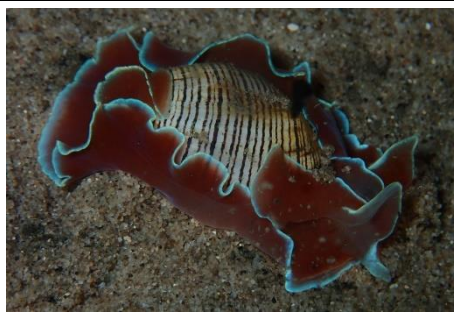
Hydatina physis (6)