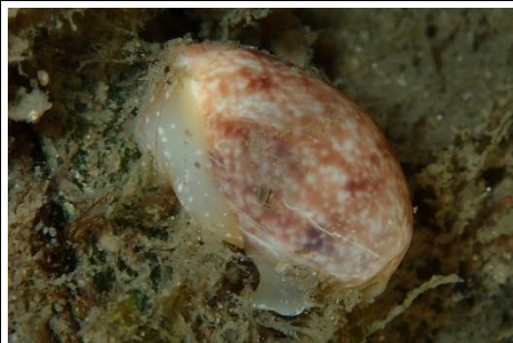
Bulla sp. (1)