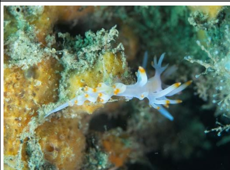
Samla bicolor (1)