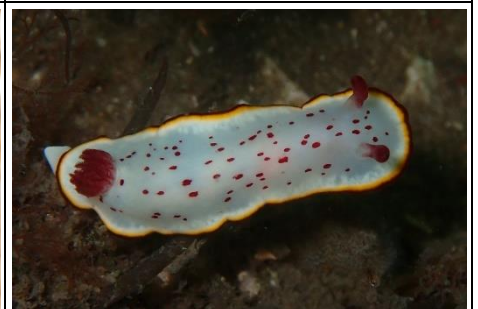
Goniobranchus daphne (7)