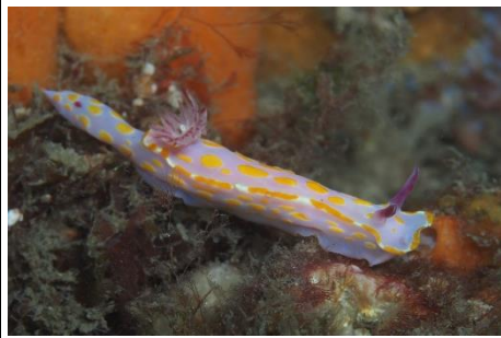
Ceratosoma amoenum (4)