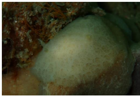
Rostanga crawfordi (2)