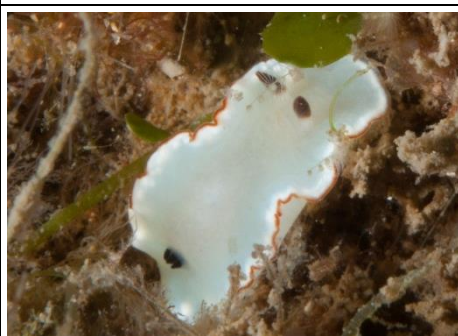
Glossodoris angasi (3)