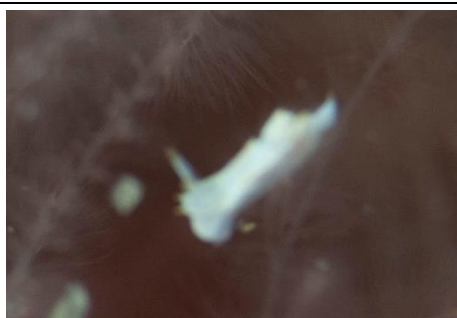
Goniodoridella savignyi (1)