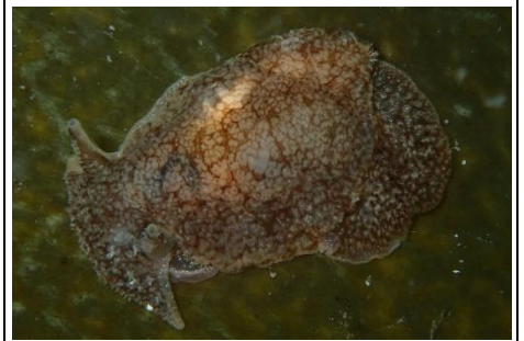
Pleurobranchaea maculata (1)