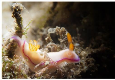
Thorunna daniellae (3)