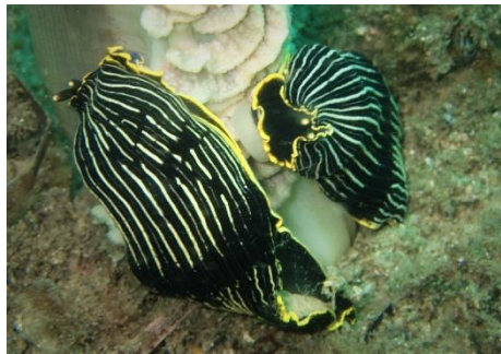
Armina magna (2)