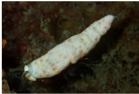
Dermatobranchus primus (1)