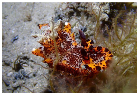
Plocamopherus tilesii (1)