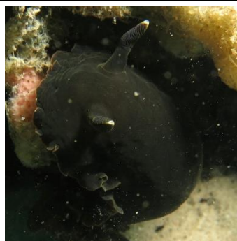
Dendrodoris nigra (2)