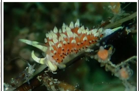
Caloria indica (4)