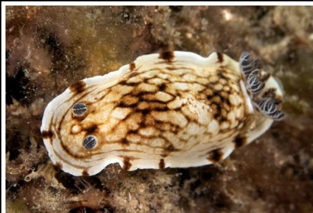
Aphelodoris varia (9)