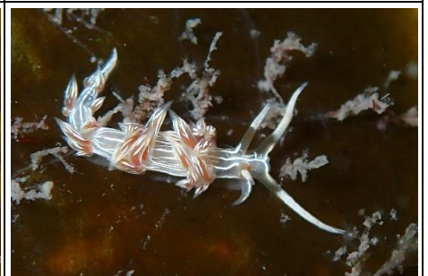
Cratena lineata (5)