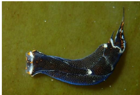
Biuve fulvipunctata (2)