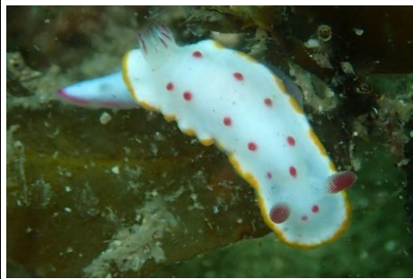
Mexichromis festiva (1)