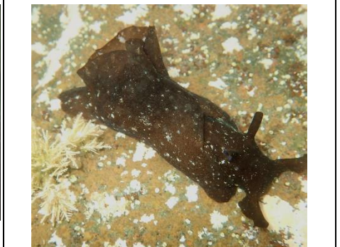
Aplysia juliana (1)