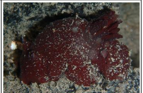
Rostanga cf. risbeci (1)