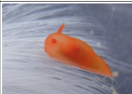
Vayssierea felis (1)