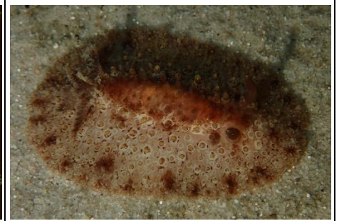
Carminodoris nodulosa (1)