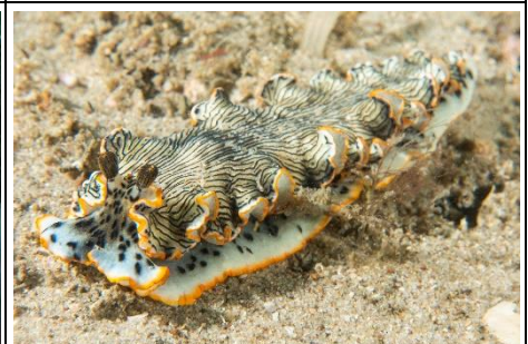
Dermatobranchus cf dendronephthypagus (3)