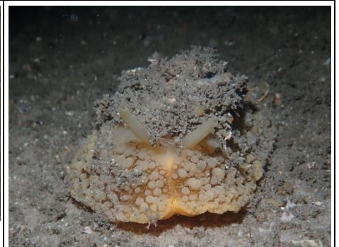
Umbraculum umbraculum (3)