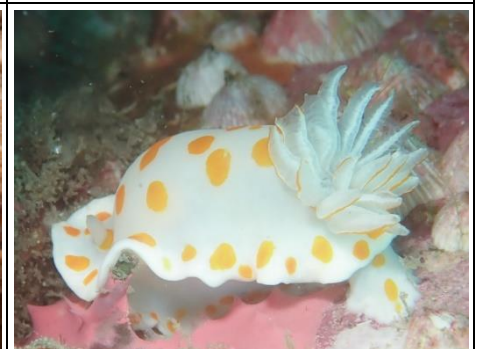
Goniobranchus tasmaniensis (1)