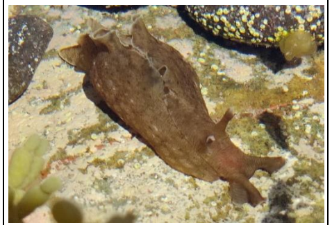
Aplysia sydneyensis (2)