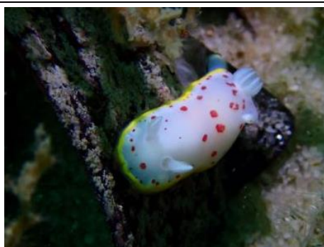
Goniobranchus hunterae (1)