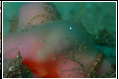
Hallaxa michaeli (1)