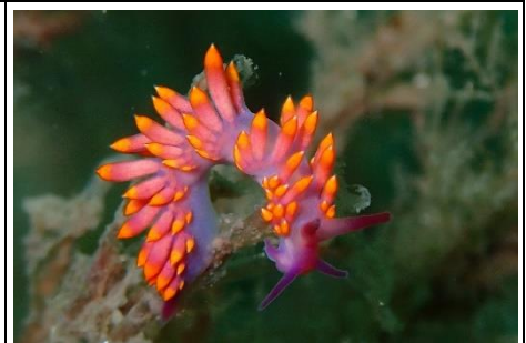
Trinchesia sibogae (4)