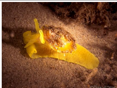
Tyrodina corticalis (1)