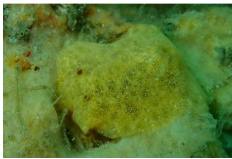
Jorunna sp.4 (1)