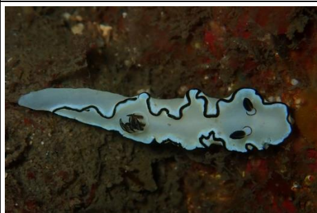
Doriprismatica atromarginata (8)