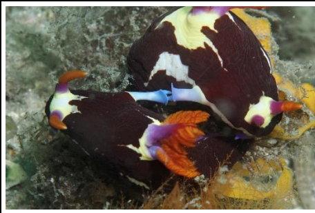
Nembrotha purpureolineata (4)