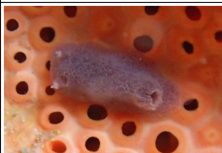
Jorunna ramicola (3)