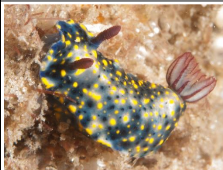
Hypselodoris obscura (8)