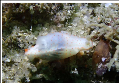
Gymnodoris alba (1)