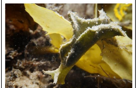
Elysia tomentosa (4)