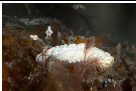
Bulbaeolidia alba (3)