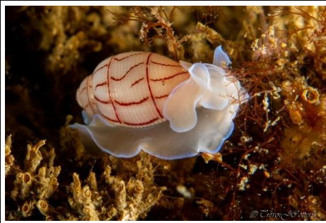
Bullina lineata (10)