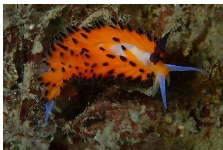
Favorinus tsuruganus (2)