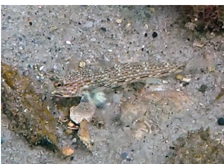
Hoeses sand goby ( Istigobius hoesei )