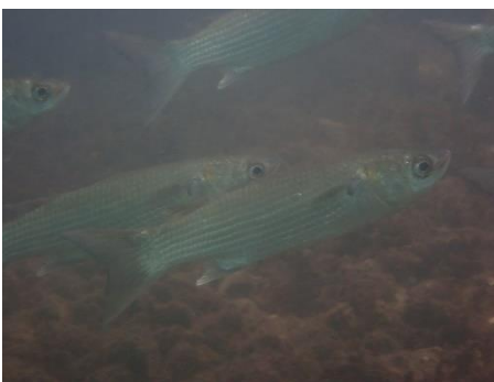
Sand mullet ( Myxus elongatus )