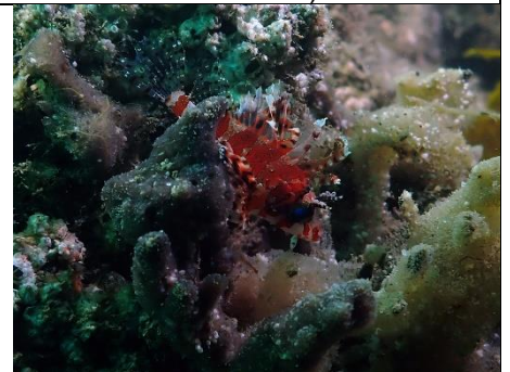
Dwarf lionfish ( Dendrochirus brachypterus )