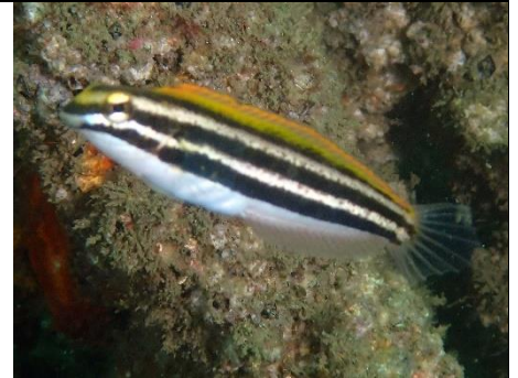
Yellow sabretooth blenny ( Petroscirtes fallax )