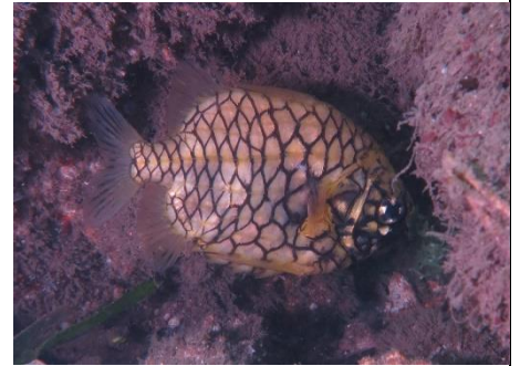
Pineapple fish ( Cleidopus gloriamaris )