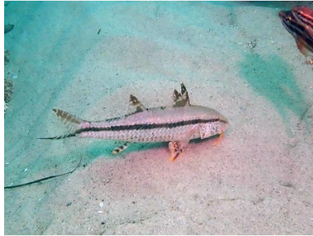
Bartail/freckled goatfish ( Upeneus tragula )