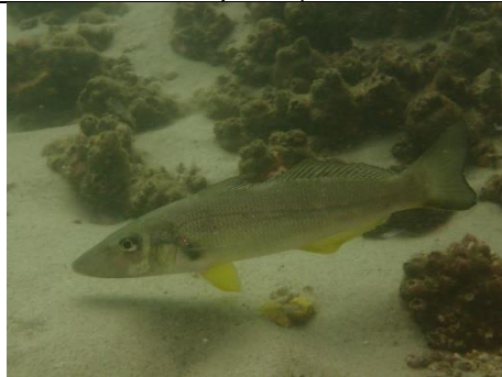
Blue-nose whiting/Sand whiting ( Sillago ciliata )