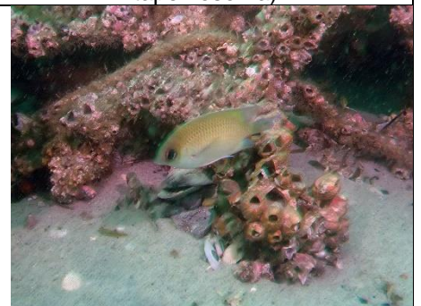
Immaculate damsel ( Mecaenichthys immaculatus )