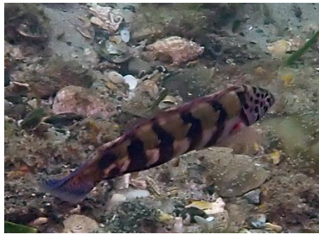
Snake-skin wrasse ( Eupetrichthys angustipes )