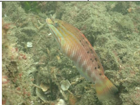
Gunthers wrasse ( Pseudolabrus guentheri )