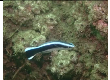
Cleaner wrasse ( Labroides dimidiatus )