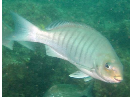
Luderick ( Girella tricuspidata )