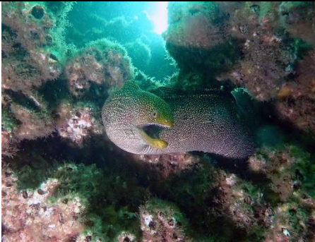
White-speckled moray ( Gymnothorax eurostus )