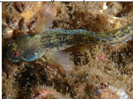
Horned Blenny ( Parablennius intermedius )