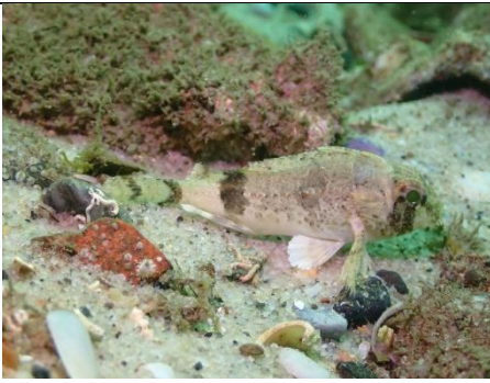
Eastern fortescue ( Centropogon australis )