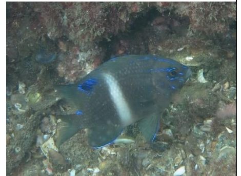
Girdled parma ( Parma unifasciata )