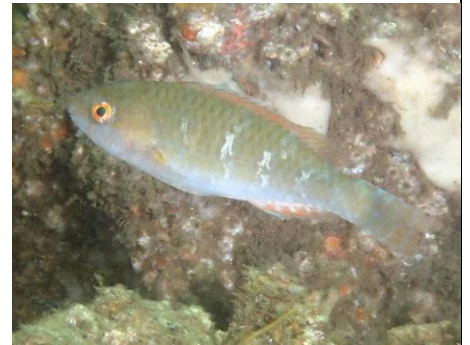
Blue-barred orange parrotfish ( Scarus ghobban )