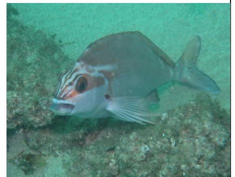
Red morwong ( Cheilodactylus fuscus )