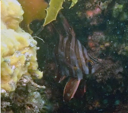
Old wife ( Enoplosus armatus )