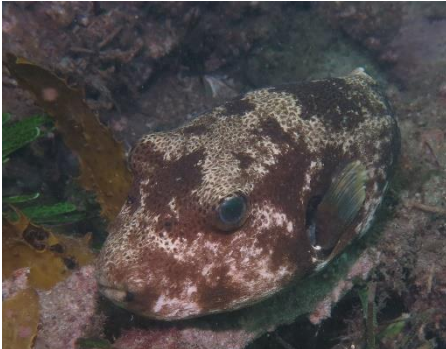
Starry puffer ( Arothron stellatus )