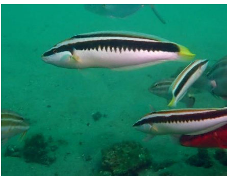
Comb wrasse ( Coris picta )