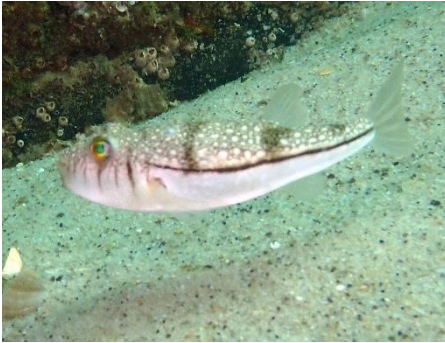
Banded toadfish ( Torquigener pleurogramma )