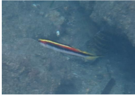
Eastern hulafish ( Trachinops taeniatus )