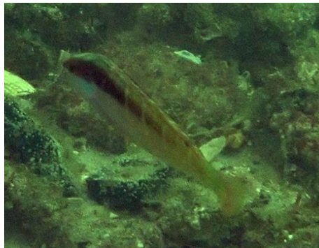
Pale-barred coris ( Coris dorsomacula )