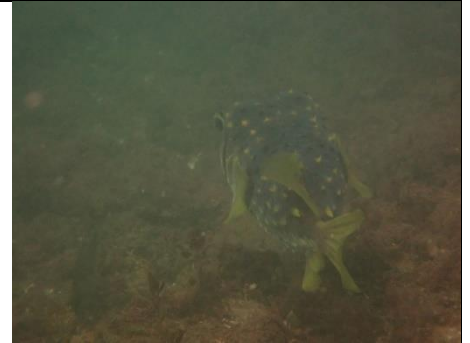
Three-bar porcupinefish ( Dicotylichthys punctulatus )