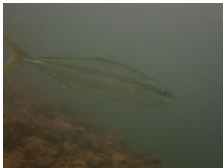
Yellow-tail kingfish ( Seriola lalandi )