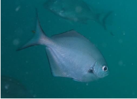
Silver sweep ( Scorpius lineolata )