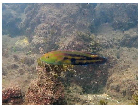
Senator wrasse ( Pictilabrus laticlavus )