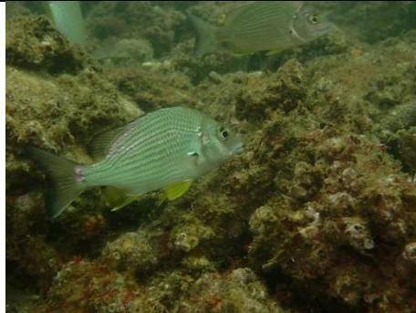
Yellow fin bream ( Acanthopagrus australis )