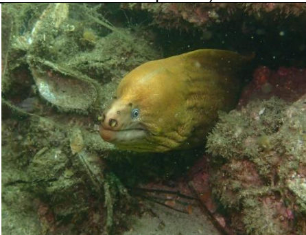
Green moray ( Gymnothorax prasinus )