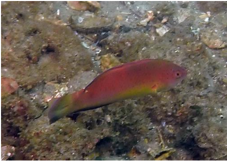
Black-spotted wrasse ( Austrolabrus maculatus )