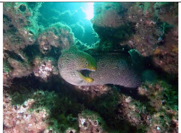
White-speckled moray ( Gymnothorax eurostus )

Between everyone taking part photos of 47 different species were submitted, with many other species seen on the day.