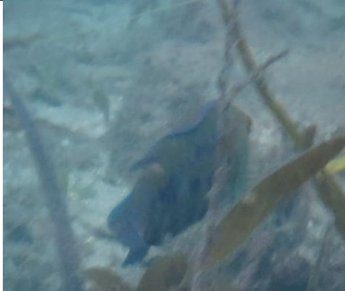
Rainbow cale ( Heteroscarus acroptilus )