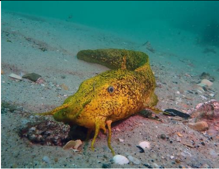
Estuary catfish ( Cnidoglanis macrocephalus )