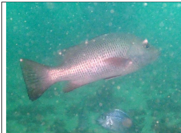
Mangrove Jack ( Lutjanus argentimaculatus )