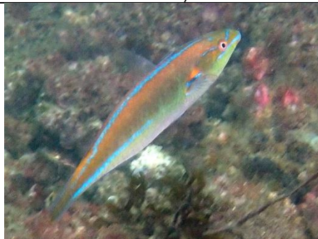
Cut-ribbon wrasse ( Stethojulis interrupta )