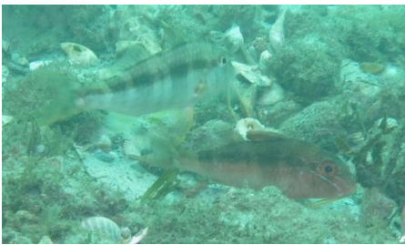
Blue-lined goatfish ( Upeneichthys lineatus )