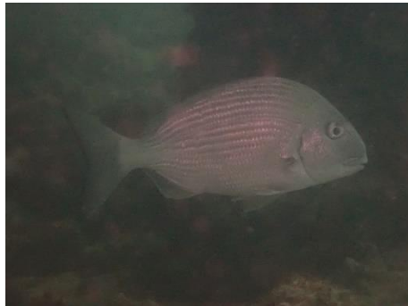
Tarwhine ( Rhabdosargus sarba )