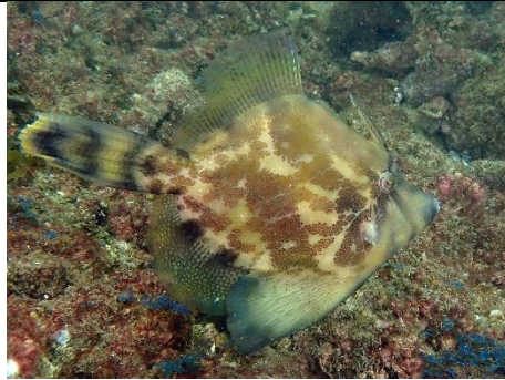
Fan-belly leatherjacket ( Monacanthus chinensis )