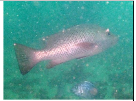
Mangrove Jack ( Lutjanus argentimaculatus )