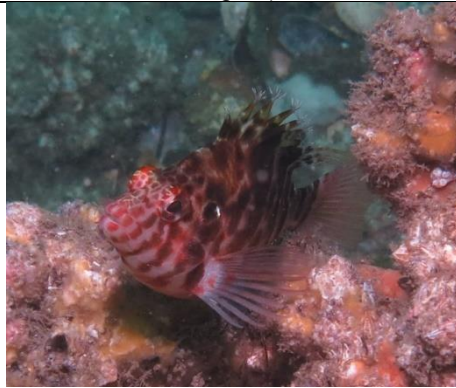
Blotched Hawkfish ( Cirrhichthys aprinus )