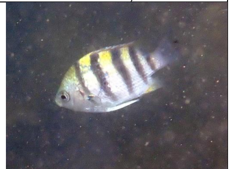
Sergeant major ( Abudefduf vaigiensis )