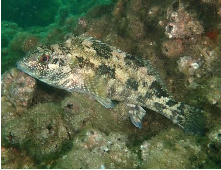
Kelpfish ( Chironemus marmoratus )