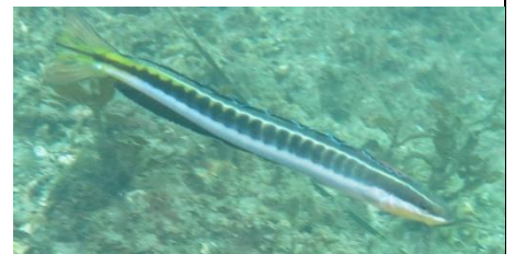
Hit and run blenny ( Plagiotremus tapeinosoma )