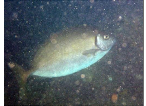
Black Rabbitfish, Happy Moments ( Siganus fuscescens )