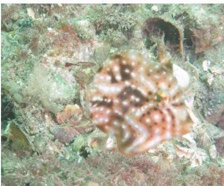
Pygmy leatherjacket ( Brachaluteres jacksonianus )