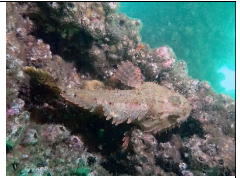
Eastern Red Scorpionfish ( Scorpaena jacksoniensis )